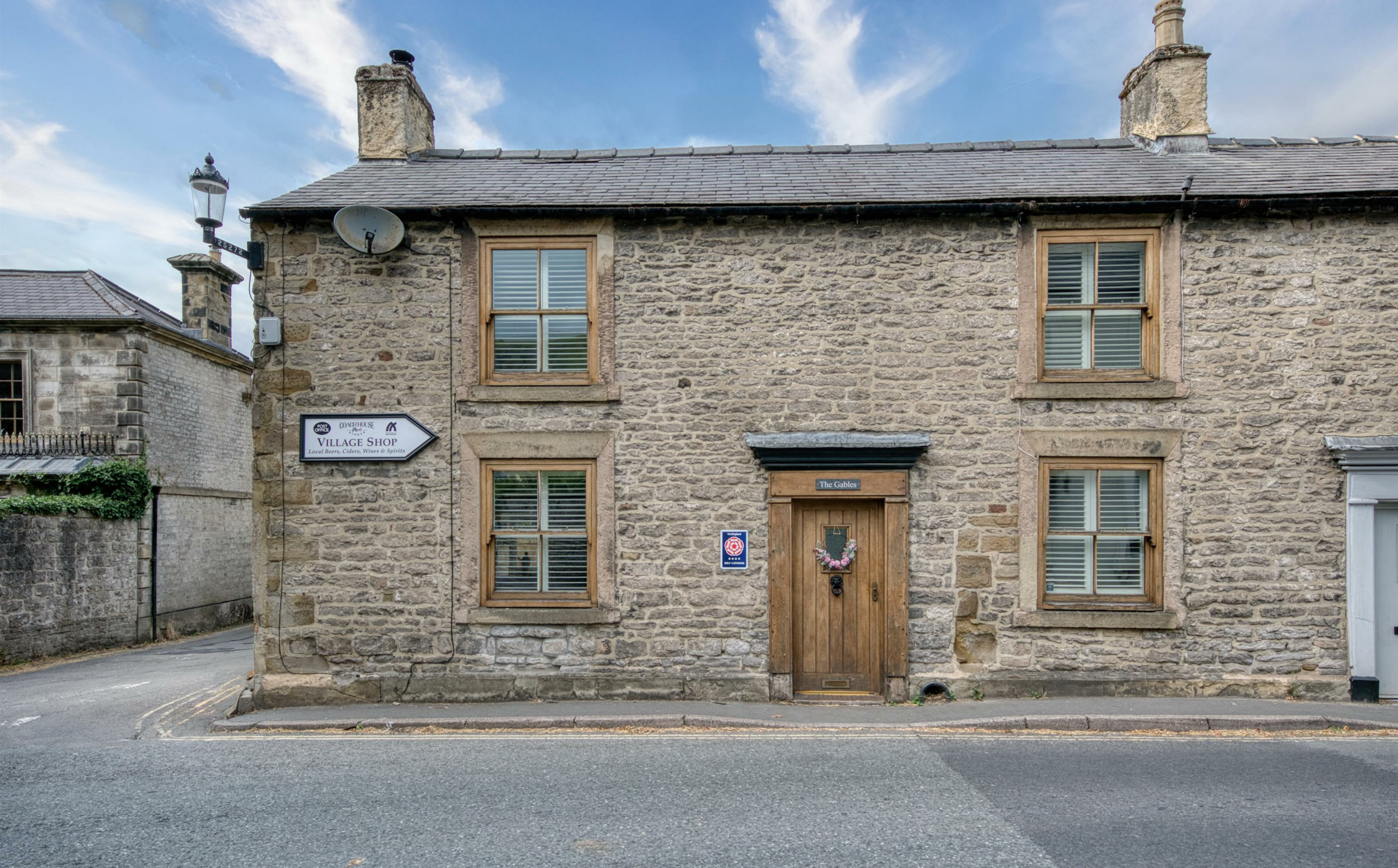
The Gables How Lane, Castleton, Derbyshire, S33 8WJ